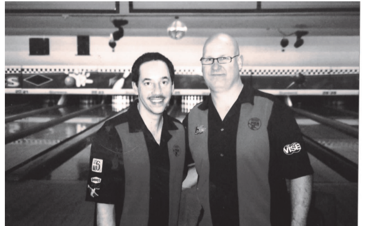
Parker Bohn III and Doug Kent are the first Brother-In Laws to bowl together in the Roo to Riches, Florida

When George H.W. Bush was campaigning for President, he bowled in public and embarrassed himself when he accidentally put on two non-sliding shoes and fell over on the lanes. At least in the White House they can screw up privately. There have been no reports issued as to whether Monica Lewinsky had any bowling talent.